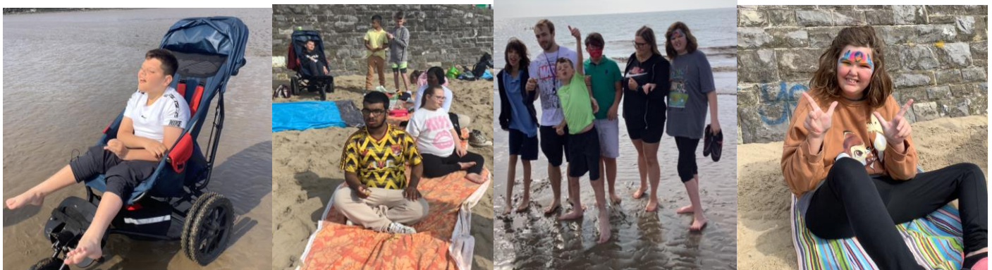
Dosbarth Afon having fun in class