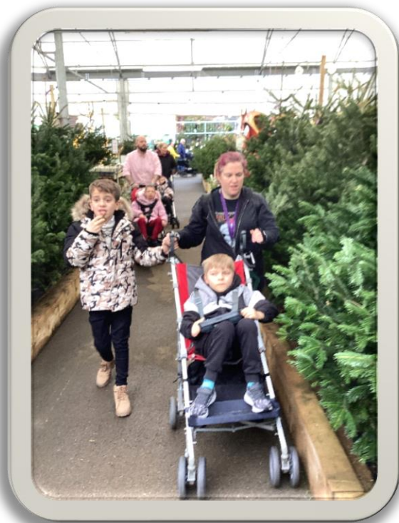
DOSBARTH TAN ENJOYED THEIR TRIP TO THE GARDEN CENTRE